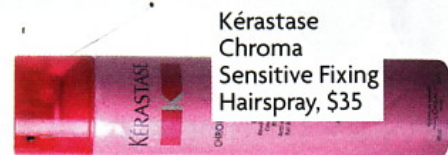
Kérastase Chroma Sensitive Fixing Hairspray, $35