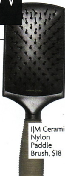
I/M Ceramic Nylon Paddle Brush, $18

Forget the cheerleader look of summer. For fall, the low ponytail is far more sophisticated and, therefore, more appropriate for women over 50. Achieving this look is quite simple, explains Altomare. Start with relatively clean hair, meaning washed the day before so that it has more texture. Brush hair out with a paddle brush. Decide whether you will have a centre part, side part or pulled straight back.