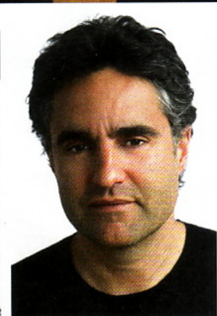
Vida Spa at Vancouver's Sutton Place Hotel

I've completely bought into the benefits."