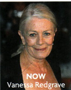
NOW Vanessa Redgrave