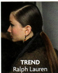
TREND Ralph Lauren