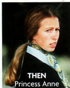
THEN Princess Anne